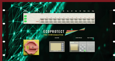
EPPM 32+ - Front View

State-of-the-art Fuses, relays, monitoring devices as well as lockable main switches contribute to safety in service and maintenance.